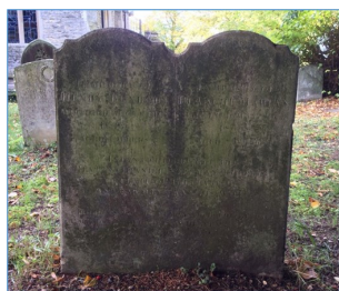
From Biddenham, the family