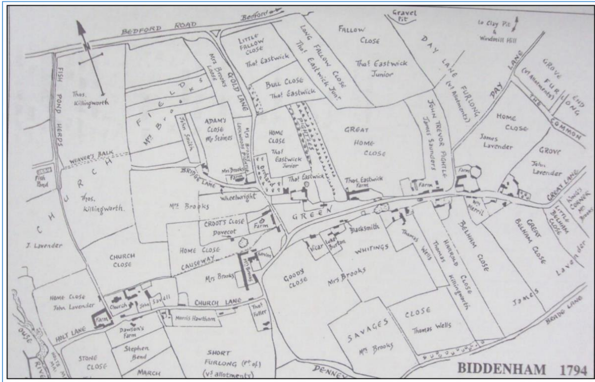
Reproduction of the 1794 map

Lockwoods Pightle: in or near the area of land concerned – pightle (sometimes Pyghtle as in the former J P White’s Pyghtle Works, once standing in Hurst Grove, Bedford, and with Biddenham associations) as in an Anglo-Saxon word for a small parcel of land, a small enclosure, a croft.